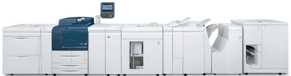
Xerox® D136 Copier/Printer shown with 2-Tray Oversized High-Capacity Feeder, GBC® AdvancedPunch™, High-Capacity Stacker, Standard Finisher Plus, Booklet Maker Finisher, Post Process Inserter and Tape Binder.