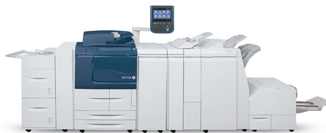
Xerox® D136 Copier/Printer shown with optional 2-Tray High-Capacity Feeder, Standard Finisher, Folder and Post Process Inserter.

Innovative production solutions to ensure a greener today and tomorrow.