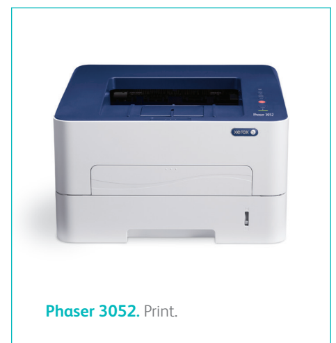
Phaser 3052. Print.