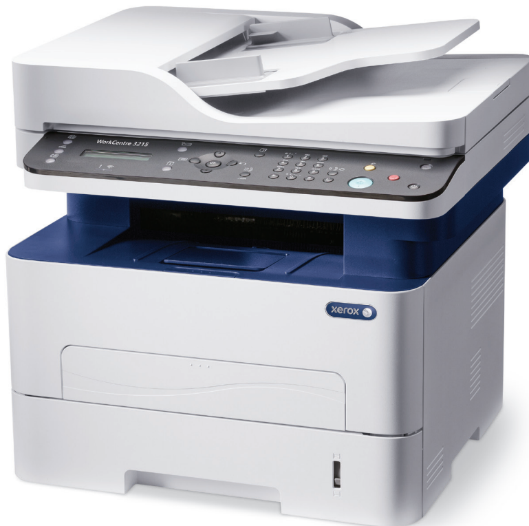
WorkCentre 3215. Copy. Print. Scan. Fax. Email.