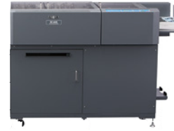
Duplo® DC-645 Slitter/Cutter/Creaser