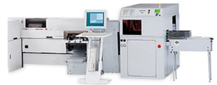
C.P. Bourg® Book Factory