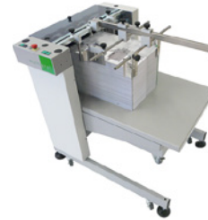
Multigraf PST-52 Stacker