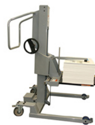
Production Media Cart