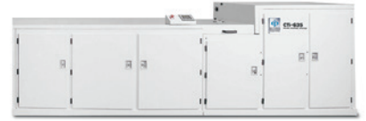
Epic CTi-635™ Inline Coating System