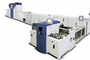
Xerox® Automated Packaging Solution for the iGen® Press