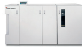
GBC® FusionPunch® II