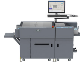
Duplo® DC-745 Slitter/Cutter/Creaser