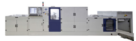
TRESU Pinta Coater