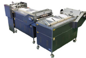
Rollem JetSlit System