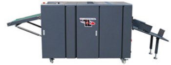
TEC Lighting Production UV Coater