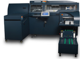
C.P. Bourg® 3202 Perfect Binder