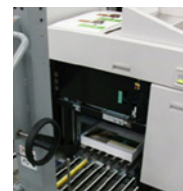
Xerox® Power Eject