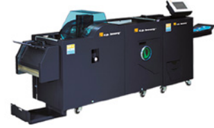
C.P. Bourg® BM-e Booklet Maker

The new generation inline Bourg Booklet Maker Enhanced (BM-e) is the first booklet maker that can handle a sheet size of 14.33" x 22.5" (364 x 571 mm). Oversize sheets can be folded and saddle stitched to create impressive 14.33" x 11.25" (364 x 286 mm) brochures, calendars or other booklets. Smaller booklets can be printed two-up to increase productivity with additional stitch heads. Booklets can be 2 to 30 sheets (75 gsm). The BM-e accepts coated or uncoated 60 to 350 gsm paper in sizes from 5.8" x 8" (147 x 203 mm) to 14.33" x 22.5" (364 x 571 mm).