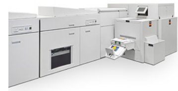
Watkiss PowerSquare™ 224

A complete book making system, the Watkiss PowerSquare 224 combines the four processes required to produce quality manuals: stitching, folding, spine forming and trimming. This finisher produces Watkiss SquareBack™ books up to 1 1/10.4 mm (224 pages/56 sheets at 70 gsm). It features fully automatic settings and includes a six-position single stitch head that allows for a variable stitch leg length to accommodate for varying book thicknesses. A cost-effective alternative to perfect binding or tape binding, the Watkiss PowerSquare 224 will automatically adjust itself based on sheet count to provide the most accurate stitch length and fold depth—on the fly—to easily accommodate a variety of jobs.