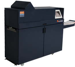
C.P. Bourg® BDF-e