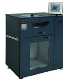
C.P. Bourg® Dual-Mode Sheet Feeder (BSF)

The BSF includes two separate feeding compartments: a lower high-capacity tray that can accommodate pile heights up to 20" (508 mm) and an upper feed drawer that accommodates pile heights up to 6.3" (160 mm) of cover or insert sheets. When in bypass mode, the upper feed tray can be used as a cover feeder. A hand scanner is used to read JDF data from job-specific printed banner sheets that travel with the stacks. The BSF is equipped with OMR mark recognition and double- and missed-sheet detection from both compartments. It also detects when either tray is empty.