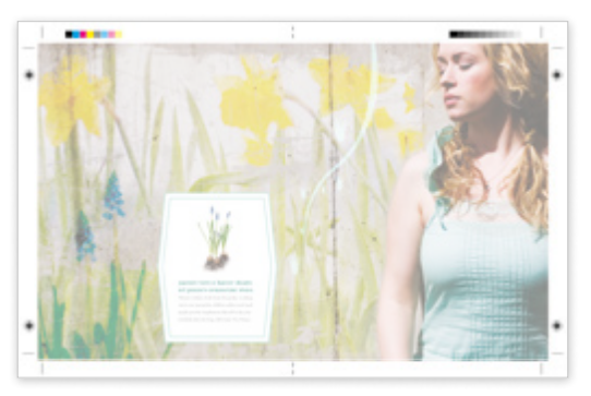
Oversize Output for A3 bleed

The Phaser 7800 colour printer gives graphic arts professionals an impressive range of business-ready finishing options to choose from. Depending on your needs and budget, you can go with the all-in-one Professional Finisher and get stacking, stapling, hole punching, booklet making and v-folding; or start with the Office Finisher LX and get stacking and stapling with the flexibility to add separate hole punching, creasing and stapling capabilities as your workload dictates.