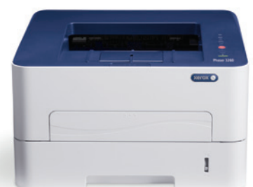
Phaser 3260. Print.